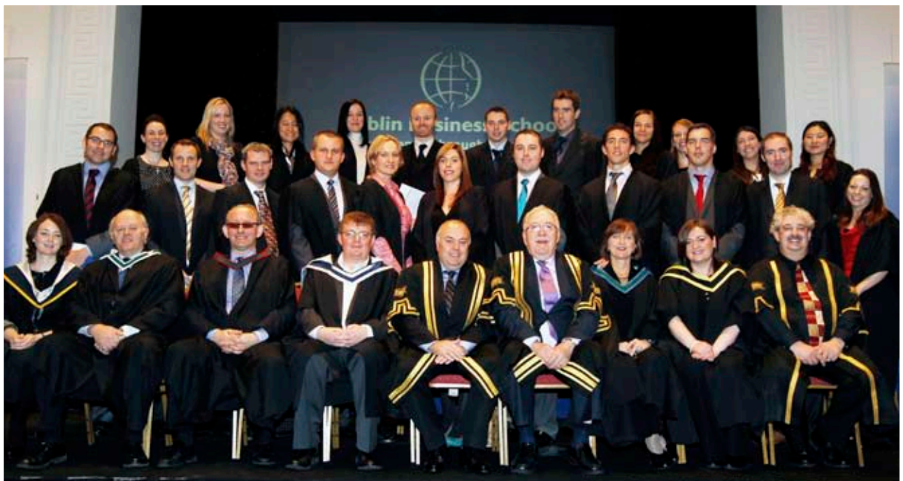
DBS Professional Accountancy Placings June 2011