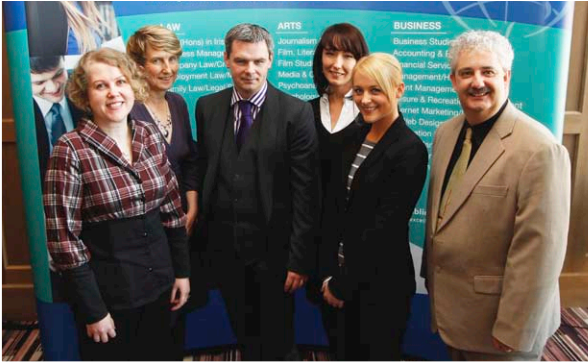
ACCA Awarded DBS 1 st in Ireland Placings December 2010