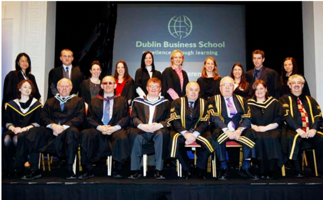
ACCA Awarded DBS Placings June 2011