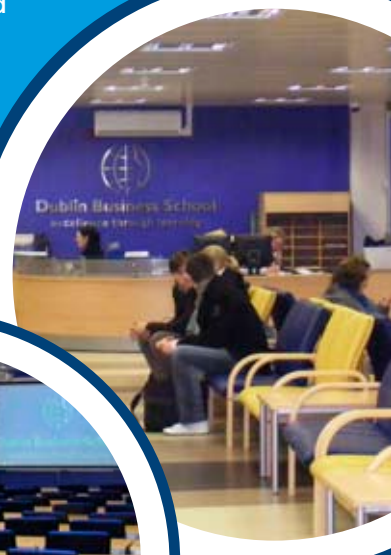
DBS Castle House, South Great George's Street, Dublin 2