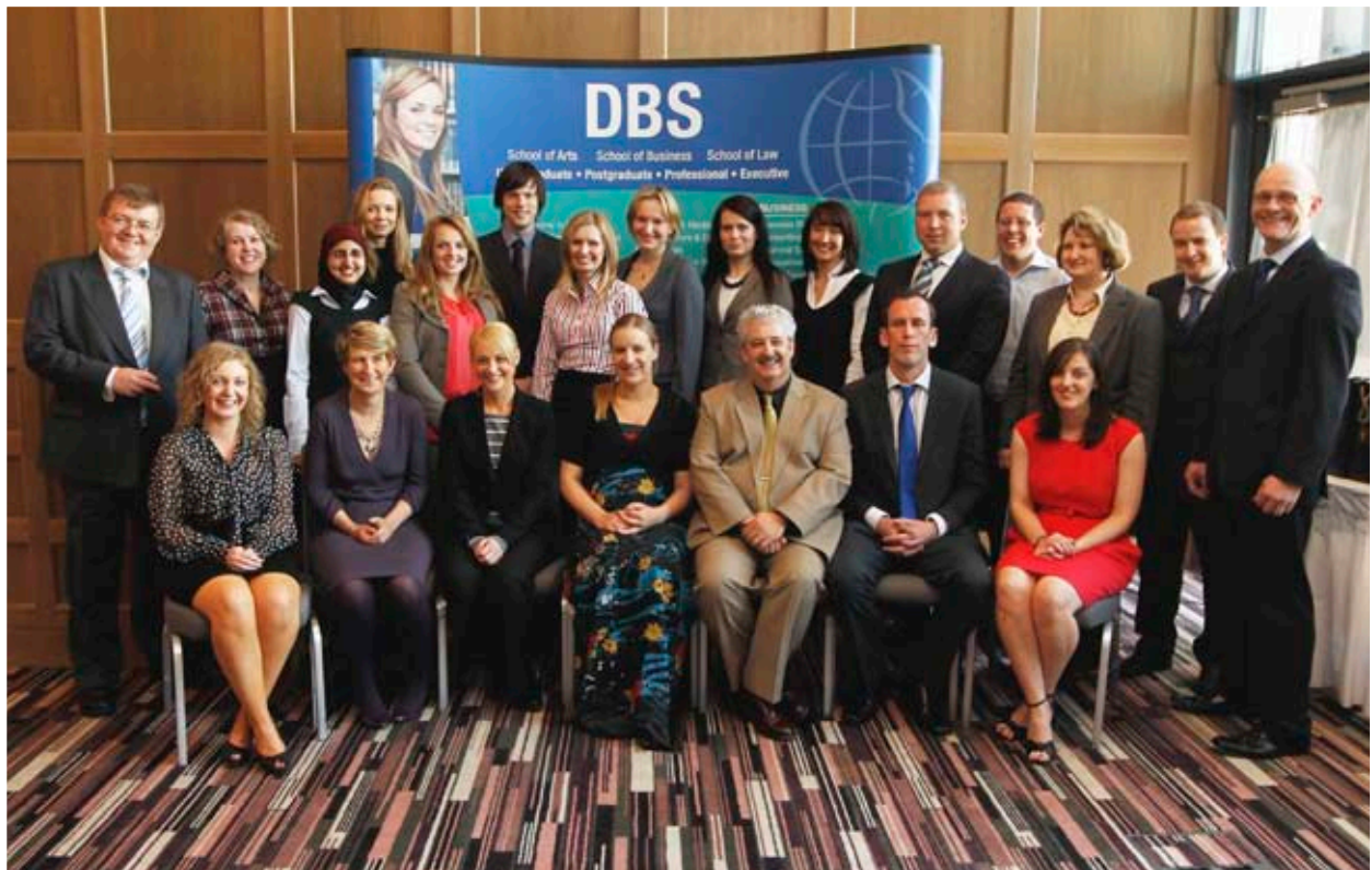
ACCA Awarded DBS Placings December 2010