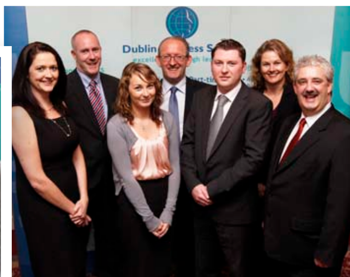
DBS CAT Worldwide Placings June 2010 examinations