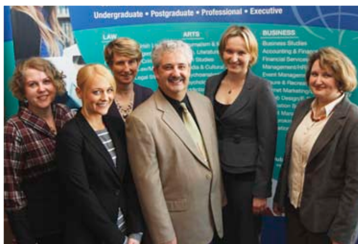
DBS CAT Worldwide Placings December 2010 examinations